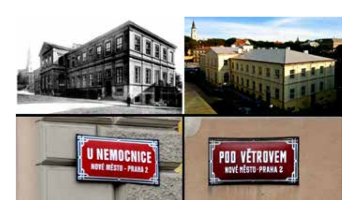
Fig. 2. Pathological Anatomy Institute of Charles University in Prague. The principal entrance is viewed from U Nemocnice avenue N^{\circ} 4. On the right side of the photo is Pod Vetrovem street, which is also where Verocay used to live, entering on the second floor (1910). The Pathological Anatomy Institute remained in the same building until 2005, when repairs were made. The building reopened at the end of 2009, after which the university used it for a different purpose.

In 1902, he was named the first "Demonstrator" of the Institute. In 1904, he gained the title "Doctor medicinae universae".