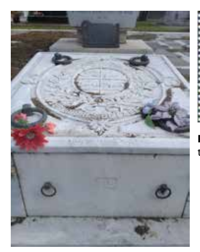
Fig. 4. Pantheon of the Servants of the Homeland in the Cemetery of the Buceo in Montevideo.

The authors declare that there is no conflict of interest regarding the publication of this paper.