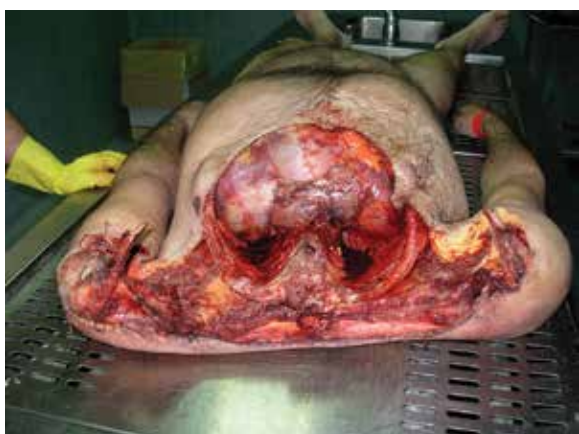
Figure 3. Intrathoracic organs were completely absent, but the diaphragm was intact so a partial symmetry of the chest could be seen.