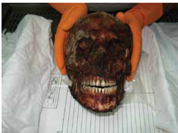
Figure 2. The examination of the skull revealed the absence of all the soft tissues, eyeballs and all the cartilaginous structures from the nose and ears.

skull was still connected with the first cervical vertebra (Atlas), and also the second cervical vertebra (Axis) was still intact and in situ. The odontoid process of the Axis was in situ, but it was for large part absent and with the remaining part (odontoid process base and the right transverse process) eroded, but not with the characteristics of brittle fracture. The calvaria showed a modification of its normal anatomy for the presence of different fracture lines. No fractures at the viscerocranium were revealed; nasal, orbit, maxilla, mandible and zygomatic bones were intact. The examination of the body revealed the absence of the cervical column and of all the anatomic formations of the neck; the first and second thoracic vertebrae (just a few fragments of the body of the second vertebra remained), the anterior arch of all