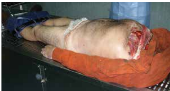
Figure 1. The clothes were extensively soil-stained.

skull was still connected with the first cervical vertebra (Atlas), and also the second cervical vertebra (Axis) was still intact and in situ. The odontoid process of the Axis was in situ, but it was for large part absent and with the remaining part (odontoid process base and the right transverse process) eroded, but not with the characteristics of brittle fracture. The calvaria showed a modification of its normal anatomy for the presence of different fracture lines. No fractures at the viscerocranium were revealed; nasal, orbit, maxilla, mandible and zygomatic bones were intact. The examination of the body revealed the absence of the cervical column and of all the anatomic formations of the neck; the first and second thoracic vertebrae (just a few fragments of the body of the second vertebra remained), the anterior arch of all