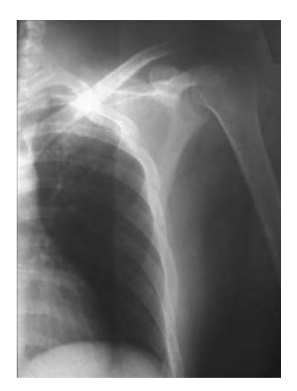
Figure 2. Thoracic X-ray is normal.