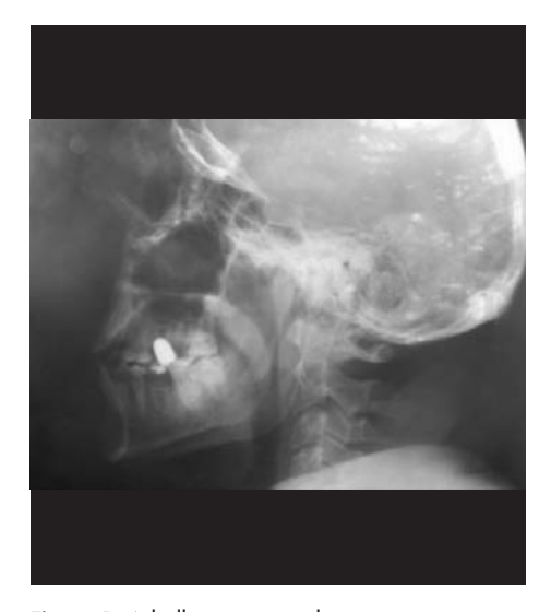
Figure 1. A bullet is seen in the tongue.