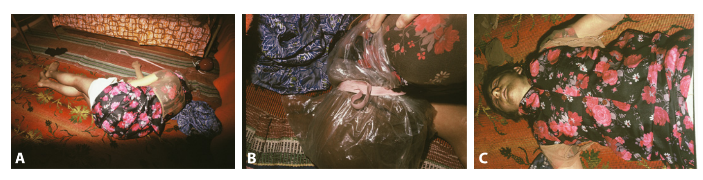
Fig. 2. The body scene of 18-year-old young man. A: Position of the deceased at the death scene. B: A plastic bag wrapped around the head of the deceased with a tape. C: The young man dressed in women's clothing.

A dead body was found lying on the ground on a carpet in a family house. Clothing suggested young, tall and slim-figured woman. A plastic bag wrapped around the head of the deceased with 2 cm wide pink duct tape made it impossible to do further identification (Figure 2A, B). Tape, identical to the material used to sew woman underwear, was wrapped around the neck three times and its loose end – 170 cm long – was laid out next to the body. Deceased was wearing tights, short blouse and a woman's two-piece suit. Another pair of tights were also put on both upper limbs (Figure 2C). After pulling off some layers of clothing, forensic pathologist present at the scene discovered that it was a body of a young man wearing four panties and three bras. Removing the plastic bag from the head showed five panties stretched over his head. Leg parts of the tights were wrapped around head and his half-open mouth